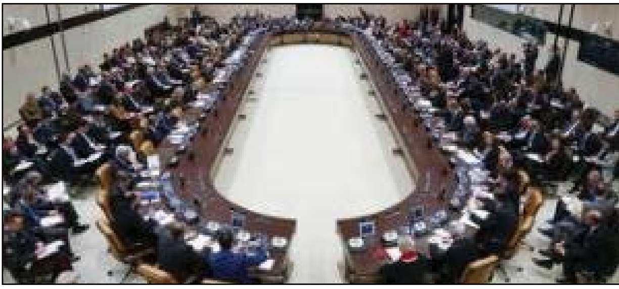
Minister Stephane Dion said on arrival in Brussels for meetings with his

BRUSSELS - NATO allies sought on Tuesday to strengthen Turkey's defenses along its Syrian border after the United States withdrew its missile defense battery for modernization, leaving Ankara exposed as Russia intensifies actions in the area. Germany has also removed its Patriot battery supporting Turkish air defenses on the frontier, leaving Spain as lone NATO ally with Patriots there, and raising strategy questions at a time when Ankara says it faces Russian airspace violations. "We need to support Turkey," Canada's Foreign