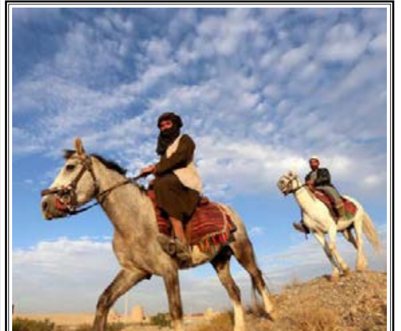
Afghan horsemen take part in a traditional game of Buzkashi in Herat, Afghanistan. 'Buzkashi' in the Dari language, widely spoken in Afghanistan, means 'goat grabbing' in English. The aim of the game is to snatch the carcass of a headless goat from the center of the field and carry it to the scoring zone.