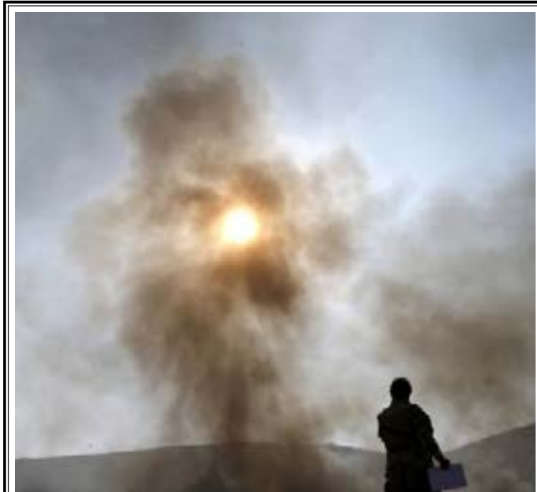
An Afghan police officer stands in front of a pile of burning narcotics in the outskirts of Kabul. Eighteen tons of narcotics which were seized in the past year around Kabul by Afghan security forces, were destroyed according to the Ministry of Counter Narcotics.