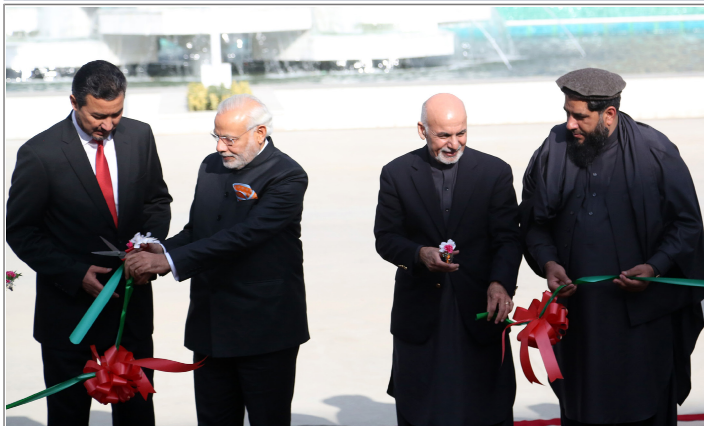
Indian Prime Minister Narendra Modi (2nd L) and President Mohammad Ashraf Ghani (2nd R) inaugurate Afghan new parliament building in Kabul on Friday December 25, 2015. Visiting Indian Prime Minister Narendra Modi and Afghan President Mohammad Ashraf Ghani on Friday jointly inaugurated an India-funded new parliament building in Kabul.

The first-ever direct talks between the Taliban and Kabul were hosted by Pakistan in July but the process collapsed after Afghanistan announced that longtime Taliban leader Mullah Mohammad Omar had died in a Pakistani hospital two years earlier. (APP)