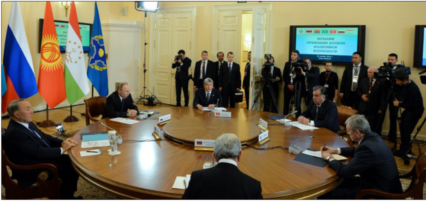
Putin, President of Armenia Serzh Sargsyan, President of Kazakhstan Nursultan Nazarbayev, President of Kyrgyzstan Almazbek

MOSCOW - "The problems in Afghanistan, the Middle East (M.E), Syria and other hot spots are all subjects of concern," said Russian President Vladimir Putin opening a meeting of the CSTO Collective Security Council in St Petersburg on Monday, Kremlin reports. "We know how complicated relations are in many parts of the world. The number of problem places and hot spots has not decreased, and we have not managed to resolve old conflicts as often as we would have liked. The problems in Afghanistan, the Middle East, Syria and other hot spots are all subjects of concern. I am very pleased therefore to have this chance to meet today and discuss all of these problems," Putin said.