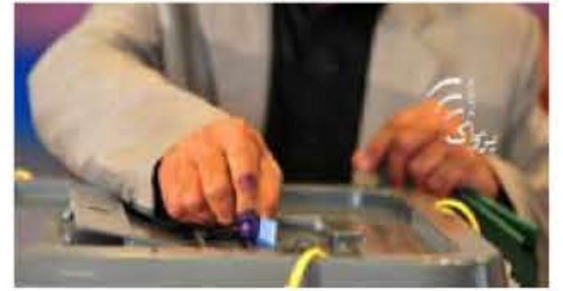
created to present its suggestions on how to reform the electoral system. But seven months on, the two leaders are yet to agree to the ... (More on P4)...(17)

KABUL - Many Afghans believe a delay in electoral reforms would further deteriorate the country's security situation. After forming the unity government, President Ashraf Ghani and Chief Executive Officer (CEO) vowed electoral reforms to ensure that future elections were fraud-free. The president had said a commission would be