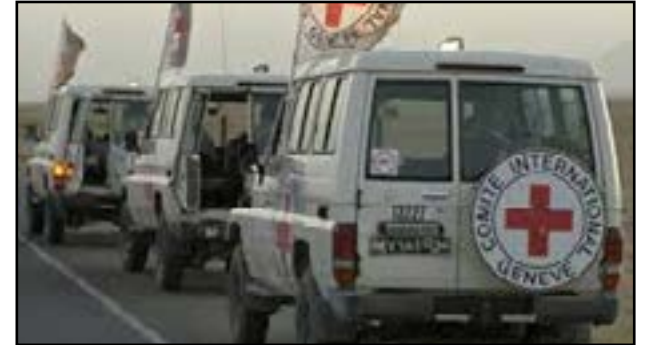
provincial police spokesman Fahim Amiri told Xinhua. Unknown armed men in Ghazni kidnapped the aid workers along a roadway on Tuesday in the province with Ghazni city as its capital, some 125 km south of Kabul. Further details about the kidnapping remained unknown. The aid agency has suspended its operations ... (More on P4)...(21)

GHAZNI - An Afghan police official on Friday said that five kidnapped staff of the International Committee of Red Cross (ICRC) were released in eastern province of Ghazni earlier on the day. "As soon as the provincial officials were aware of the abduction, efforts were put in place by local officials and tribal elders to secure the safe release of the abductees. Following the mediation of local elders, the five were freed in Chahar Deah area of Waghaz district at around midday,"