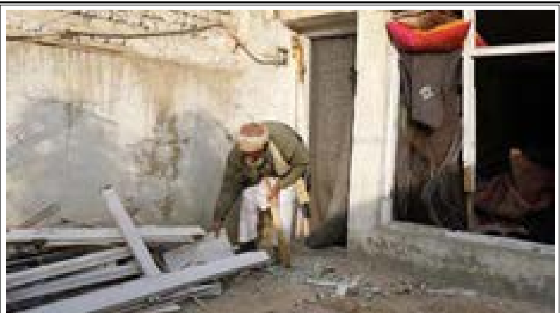
An Afghan man collects his belonging on Saturday January 02, 2015 after a suicide bomb attack that targeted French restaurant Le Jardin, in Kabul.