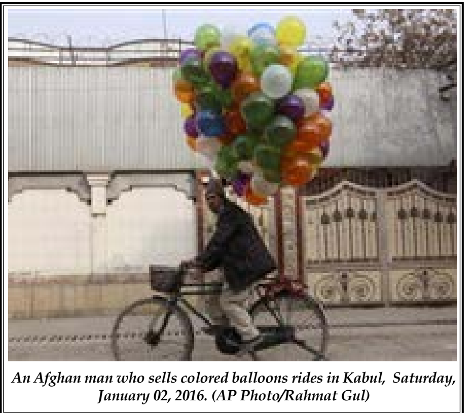
An Afghan man who sells colored balloons rides in Kabul, Saturday, January 02, 2016.