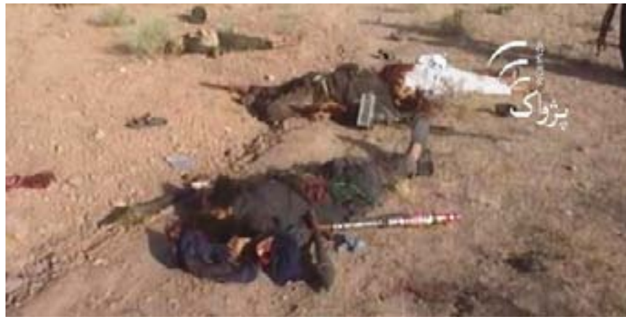
the police officer, who said the security forces had entered Chalikhel, Qolakhel and Narikhel villages. The militants were unable to put up strong resistance, he claimed, saying locals were extending full support to their security forces by helping in identification of the insurgents.