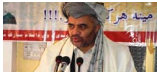
ance in Paktika. In an exclusive interview with Pajhwok Afghan News, the governor said he would try to bring reforms to provincial