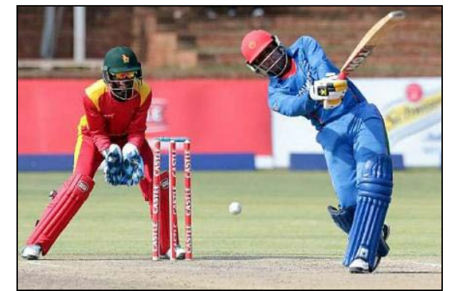
for his team and notched 50 runs off 53 balls. The next match of the series takes place on Tuesday at the Harare Sports Club.