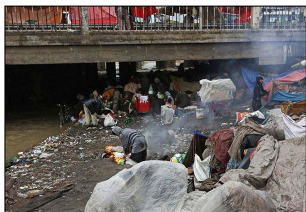
is used in making heroin, were also destroyed. "The crackdown on these labs are part of efforts to fight drug addiction in Afghanistan," Zabihullah Dayem, a senior adviser to the counter-narcotics minister, told Al Jazeera. (Aljazeera)

KABUL - Officials say six heroin laboratories have been destroyed in the south of Afghanistan, a country that is not only a world leader in producing drugs, but also a leading consumer. The Ministry of Interior said the laboratories were destroyed during a special military operation late on Saturday in Bando village in Helmand province. The ministry said 1,090kg of morphine, 15,175kg of ammonium chloride and 2,000 litres of liquid opium, which