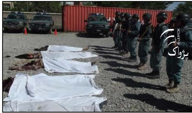
to the statement. Two security officials also killed in clashes with militants. Militants have yet to comment about the incidents.

KABUL - Two security forces and 18 militants have been killed in separate clashes in parts of the country in past 24 hours, the Ministry of Defence (MoD) said on Friday. Fourteen rebels had been killed in Giro and Andar districts of southern Ghazni province while four others perished in Kot and Achin districts of eastern Nangarhar province, a statement from MoD said. Among the dead rebels were Daesh insurgents, according