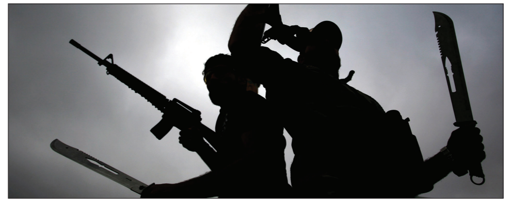
Taliban confirmed the overnight clash, the group spokesman Zabihullah Mujahid said three security forces and one of their fighters were killed, five security personnel and two Taliban wounded.