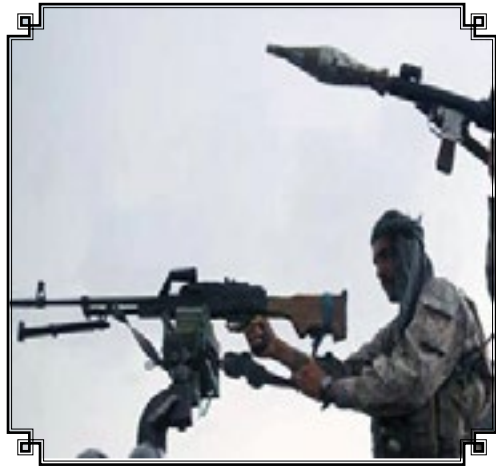
security force members were injured during the operations.

KABUL - At least 13 insurgents have been killed and seven others injured in a series of coordinated operations over the past 24 hours by the Afghan National Security Forces (ANSF), the Ministry of Interior (MoI) said in a statement on Sunday. The operations were conducted in Kandahar, Uruzgan, Ghazni, Khost, Paktika, Paktiya, Badghis and Helmand provinces, the statement said. "Also, during these operations, Afghan National Security Forces discovered and confiscated light and heavy rounds of ammunition," it said. The MoI, however, did not comment on whether any