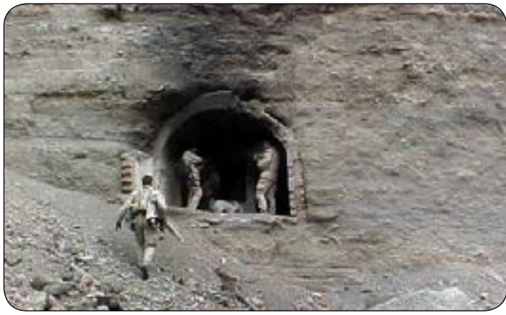
also confiscated by the Afghan forces during the operations, 209th Shaheen Corps added. The statement also added that various villages were cleared from... (More on P4)... (16)