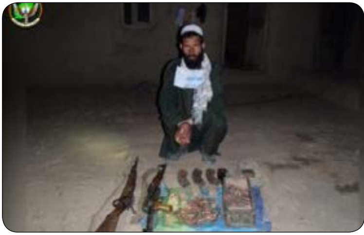
the Afghan intelligence operatives confiscated 80 kg of explosives, two rifles with 4 magazines and 400 rounds of ammunition, NDS added. The anti-government armed ... (More on P4)... (20)