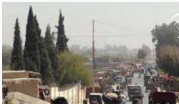
of a commission tasked with resolving the issue, said: "We have launched an investigation to find out individuals who had illegally occupied the homes."