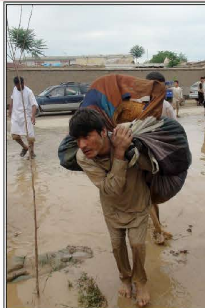
Afghans carry goods from a damaged house after a heavy rain in Kunduz province, northern Afghanistan on Tuesday May 12, 2015. Flood damaged around 500 houses in Kunduz province.

D-100 - 116, 4th Floor, Gul Bahar Center, Malik Asghar Square, Kabul, Afghanistan