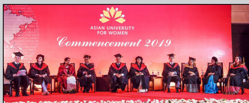
Asian University for Women (AUW) hosted its Seventh Commencement Ceremony on the 11th of May 2019 at the Radisson Hotel, Chattogram. The Commencement was presided over by Chancellor Cherie Blair.

CHITTAGONG - Asian University for Women celebrated its Seventh Commencement in Chattogram today to the tunes of Tagore's Anandoloke and Aguner Poroshmoni sung by the University's choir representing students from many countries. 100 students from 12 countries, majoring in Philosophy, Politics and Economics; Economics; Environmental Sciences; and Public Health were awarded with Bachelor's degrees on the occasion.