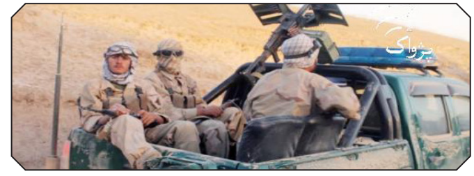
machine gun and police vehicle from the base. The deputy provincial council member said 15 security officials, including an injured Afghan Local Police (ALP) official, who were trapped inside the facility had been evacuated with the help of local elders... (More on P4)...(18)

PUL-I-KHUMRI - A Provincial Council Member said on Saturday that Taliban captured a police training centre in the Dand-i-Ghori district of southern Baghlan province.