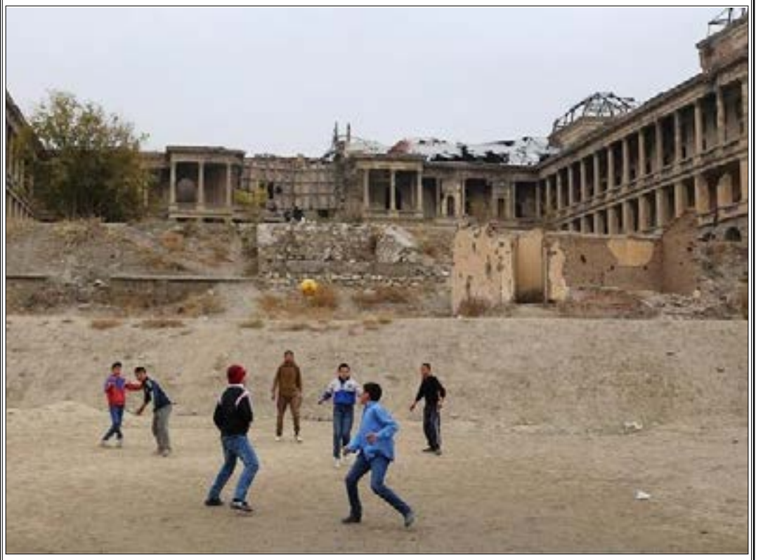
KABUL - Afghan boys play football in front of the Darul Aman Palace, which had been destroyed during the civil war in 1990s, in Kabul, Afghanistan.

to food and have to cope with harsh winter conditions. Amid the unprecedented influx of refugees to European Union nations, the EU now appar- ently seems reluctant to welcome new arrivals. An EU source on Monday said that the union was considering new meas- ... (More on P4)... (14)