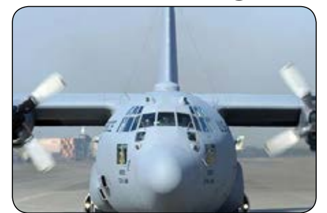
...said an investigation is underway. According to NATO information currently around 1,000 coalition forces including U.S and Poland forces are based the eastern Afghanistan beside Afghan security forces. (Tolonews)

JALALABAD - A C-130 U.S. military transport plane crashed on Thursday in Nangarhar province. According to Nangarhar province police the crash took place Thursday night at the airport of Jalalabad city of Nangarhar province. A U.S. Colonel confirmed the incident and said that eleven people including five civilian contractors were killed in the crash. The cause of the crash is not yet clear but a U.S. senior military official