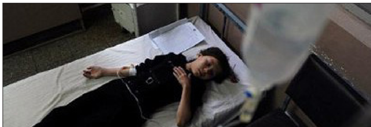
among many families in Afghanistan. No group including the Taliban has claimed responsibility for the incident.

KABUL - Local officials said more than 100 school girls were poisoned in western Herat province early Monday. The incident took place in Herat city when the girls were at school, said officials. The girls have been taken to a nearby hospital for treatment, officials said. "So far it's not clear how the incident happened but we have started investigations," officials said. Officials did not provide further details about the incident. Poisoning of school pupils, especially at girls schools, has increased in recent months - sparked concern