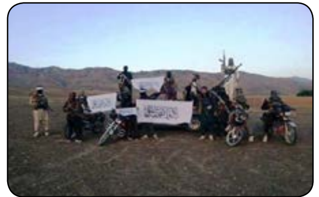
casualties. Local elders accused Daesh fighters of setting alight civilian houses, sparking a gun-battle between residents and fighters. They claimed 14 civilians were killed and 22 others abducted by Daesh fighters. (Pajhwok)

Resident Obaidullah confirmed the gun-battle and torching of houses but did not have exact information regarding the