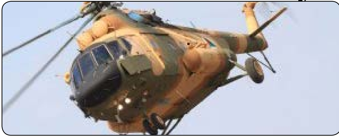
that 10 soldiers from the Afghan National Army (ANA) also embraced martyrdom in landmine explosion and enemy fire. The statement does not specify the location of the incident. (KP)

KABUL - Ministry of Defense (MoD) said that 148 insurgents have been killed and in newest security operations in 18 provinces. A statement issued by the ministry on Saturday states that the operations were conducted in Kunar, Ghazni, Logar, Paktia, Paktika, Khost, Kandahar, Uruzgan, Daikundi, Zabul, Ghor, Farah, Baghlan, Sar-i-Pul, Kunduz, Faryab, Takhar and Helmand provinces in past 48 hours. According to the press released, 77 militants were killed, 71 wounded and 8 others detained during these operations. The press release further states