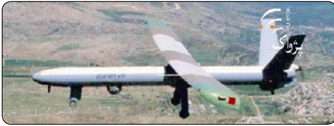
unnamed said five other insurgents were arrested by police in the same area on Sunday morning. The Taliban have not yet commented on the incident. (Pajhwok)