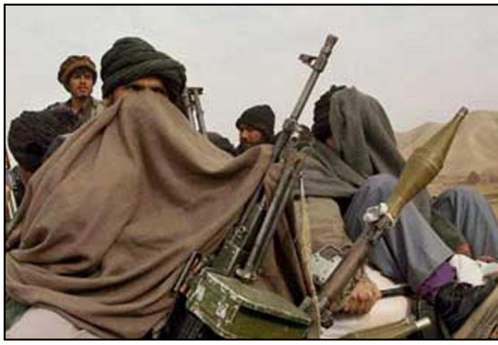
group were killed in the operation. Al-Qaeda group did not comment on the incident so far.

KABUL CITY - At least five Pakistani Al-Qaeda rebels have been killed during an operation in Southern Zabul province, a statement from National Directorate of Security (NDS) said Monday. According to the statement received by Pajhwok Afghan News, the operation was launched in Nasaryan area of Mizani district of the province. The source added that a center of Al-Qaeda militants was destroyed and five rebels belonged to the