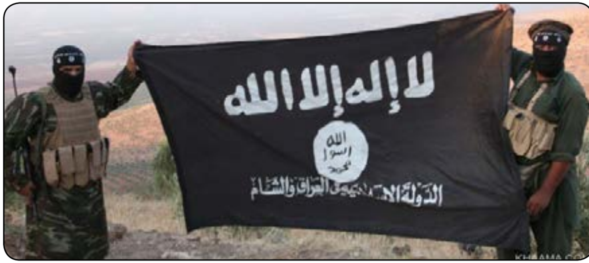
number of provinces in Afghanistan," the report said. Quoting the Afghan government sources, the report said "sightings of the groups with some form of ISIL branding" ... (More on P4)...(17)

KABUL - Around 70 militants of the Islamic State of Iraq and Syria (ISIS) terrorist group are busy in forming the core of the group's branch in Afghanistan, it has been reported. According to a UN report the terror group is making inroads in Afghanistan with the number of sympathizers and followers growing across the country. The report further added that the group is recruiting followers in at least 25 provinces of Afghanistan with 10 percent of the sympathizers belonging to the Taliban group. "The number of groups and individuals who are openly declaring either loyalty to or sympathy with ISIL continues to grow in a